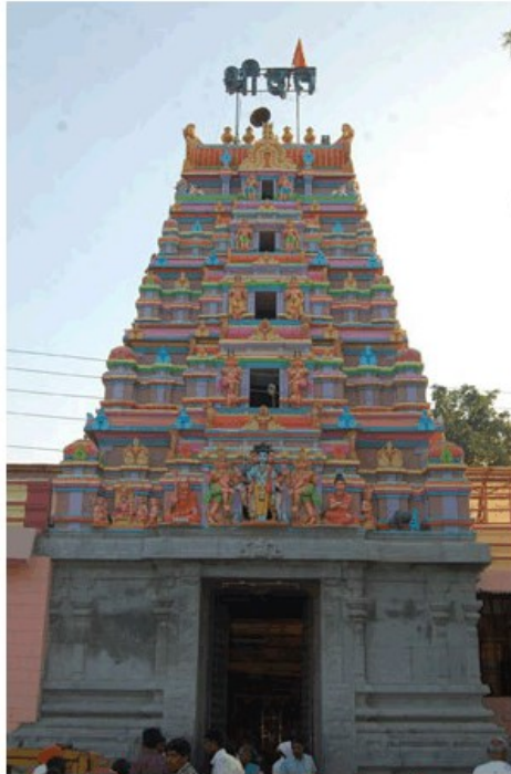
Main entrance to the temple

Shree kshetra Ganagapur is a holy place of Lord Dattatreya and the place is very important "Darshaneeya kshetra". The place is connected to "Sri Nrusimha Saraswathy Swamy" who is the second incarnation of Lord Dattatreya. Importance of this kshetra was explained by ShreeGuru which can be seen in "Shree Gurucharitra". This Nirguna Mutt is adorned with the Nirguna Padukas.