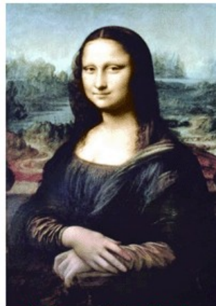
His famous painting - Mona Lisa

About 1482 Leonardo entered the service of the duke of Milan, Ludovico Sforza, having written the duke an astonishing letter in which he stated that he could build portable bridges; that he knew the techniques of constructing bombardments and of making cannons; that he could build ships as well as armored vehicles, catapults, and other war machines; and that he could execute sculpture in marble, bronze, and clay. He served as principal engineer in the duke's numerous military enterprises and was active also as an architect. In addition, he assisted the Italian mathematician Luca Pacioli in the celebrated work Divina Proportione (1509).